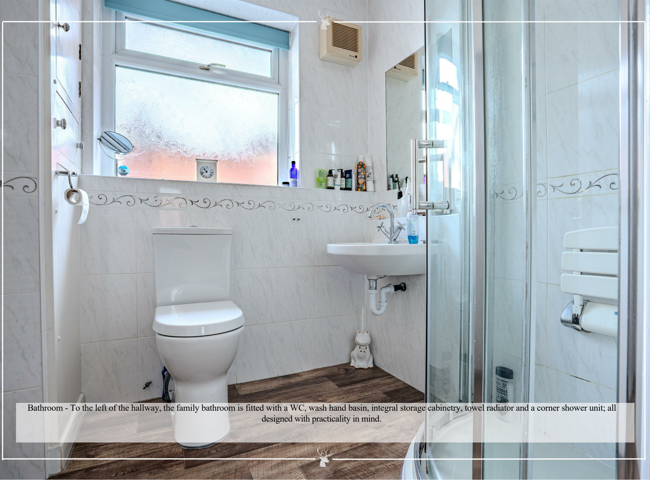
Bathroom - To the left of the hallway, the family bathroom is fitted with a WC, wash hand basin, integral storage cabinetry, towel radiator and a corner shower unit; all designed with practicality in mind.